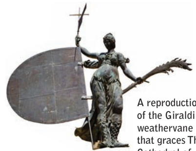
A reproduction of the Giralddillo weathervane that graces The Cathedral of Sevilla crowns the West Tower.

In keeping with our other prestigious addresses in New York and California, Alhambra Towers reflects The Rockefeller Group's® commitment to excellence.